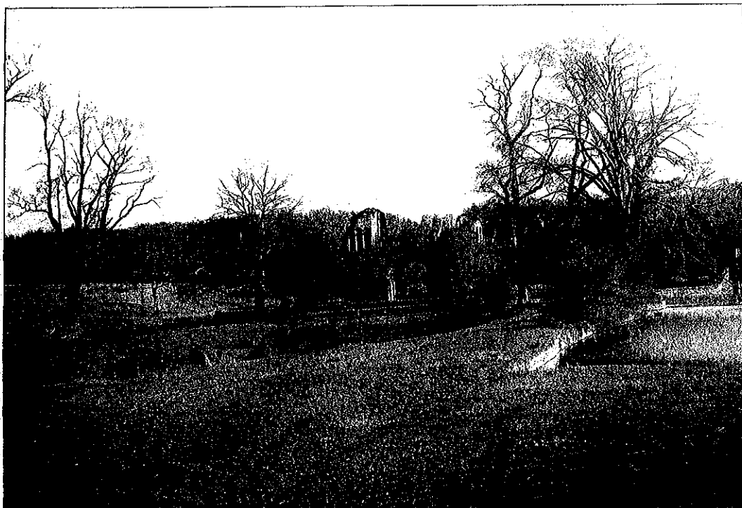
THE RUINS OF LILLESBALL ABBEY, AND THE TROUT POND (Lot 2).